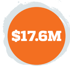
Salaries & Benefits